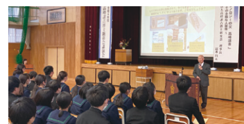
A talk held at a junior high school in Takaoka City, Toyama Prefecture. This marks the 16th year of talks given at schools.

Additionally, in May of 2024, Dr. Takamine was inducted into the National Inventors Hall of Fame of the United States. This is a non-profit organization sponsored by the United States Patent and Trademark Office that honors great inventors. The induction recognizes Dr. Takamine's contributions to medicine and industry through the extraction of adrenaline and the invention of Takadiastase, as well as his efforts to promote friendly relations between Japan and the United States. As a Japanese organization, we feel deeply proud to see that even after 100 years, his achievements are still being recognized and celebrated in the United States today.