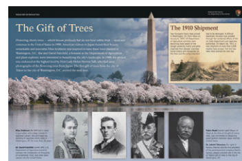
From left to right: Eliza Scidmore, the woman behind the idea for the cherry tree project; botanist David Fairchild; Tokyo Mayor Yukio Ozaki; and Jokichi Takamine.