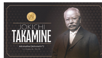
Induction to the National Inventors Hall of Fame is not limited to living people. Historical inventors, including Thomas Edison, Nikola Tesla, and Steve Jobs, have been inducted in previous years.

Scan the QR code to visit the Study Group's website.