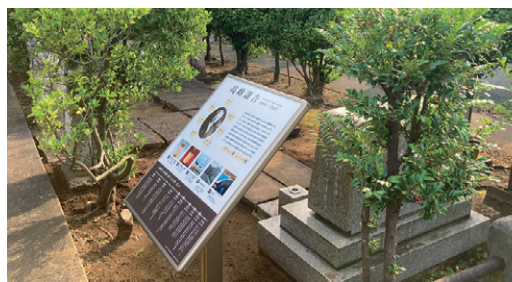
Takamine's grave (Aoyama Cemetery) *Detailed directions are available on the website.

Dr. Takamine is buried in Woodlawn Cemetery in New York, but there is also a Takamine family grave in Tokyo's Aoyama Cemetery. In commemoration of the 100th anniversary of his passing, the Study Group installed a signboard honoring Dr. Takamine's achievements. If you are ever on a stroll in the area, please stop by. Although it is not well known, many people from his hometown or who were closely related to him are buried in Aoyama Cemetery. It can be interesting to visit these other graves and think about the history they carved together.